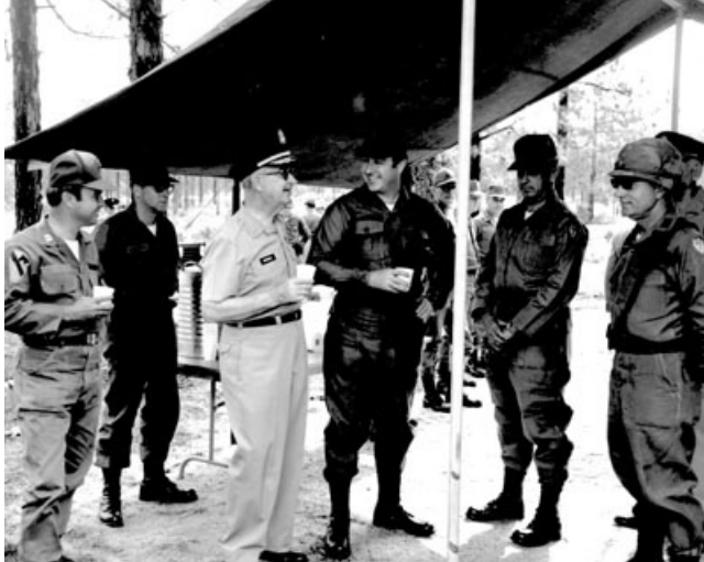
North Carolina Governor Bob Scott at Fort Bragg, c.1972.

Fort Bragg [5] , a 300-square-mile military cantonment and reservation in Hoke [6] and Cumberland [7] Counties, was