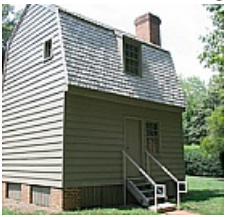
Andrew Johnson's birthplace, Raleigh,

Andrew Johnson began his life in a small wooden house, which is still preserved in Raleigh at the Mordecai Historic Park