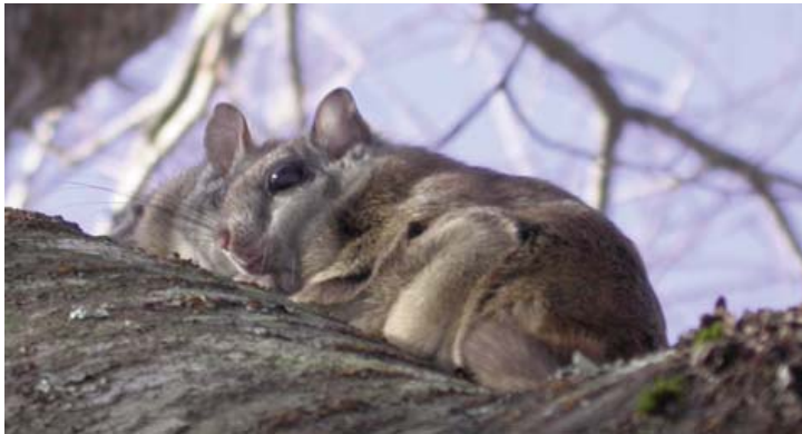
Carolina Northern Flying Squirrel