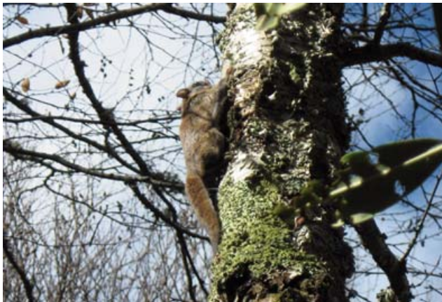
A gliding tree squirrel

Most North Carolinians never see the northern flying squirrel because it lives in the high mountains and it is nocturnal. We have affected the squirrels' habitat in several ways. Logging and subsequent fires during the early part of this century changed large areas of high elevation forests in the Great Balsam [6] and Black [7] Mountains. These forests are still recovering from that disturbance. The balsam woolly adelgid, an insect pest, has infested and killed most of the mature Fraser fir [8] stands in North Carolina. The hemlock woolly adelgid is currently decimating hemlock stands. Fortunately, for the squirrel, it can also live in northern hardwood and red spruce forest.