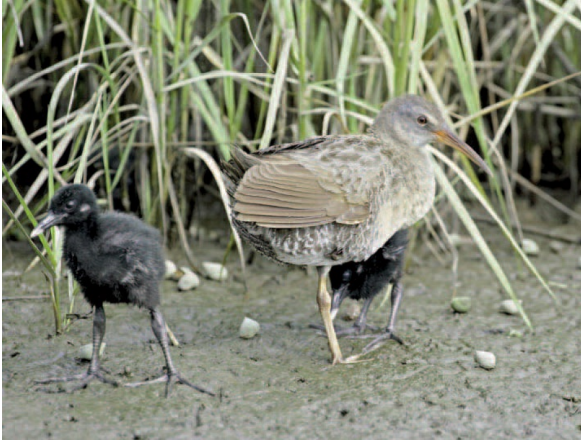
limited.Clapper rail with chicks.

a lack of funding for rail research, basic information regarding life history and yearly population status is still somewhat