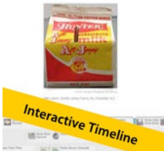
State Symbols Timeline

To read entries about many of North Carolina's most well-known state symbols and the history of North Carolina in Spanish, visit this NCpedia link: https://ncpedia.org/libro-de-hechos-de-el-viejo-estado-del-norte [6]