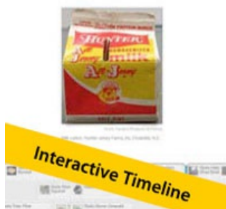
State Symbols Timeline

To read entries about many of North Carolina's most well-known state symbols and the history of North Carolina in Spanish, visit this NCpedia link: https://ncpedia.org/libro-de-hechos-de-el-viejo-estado-del-norte [6]