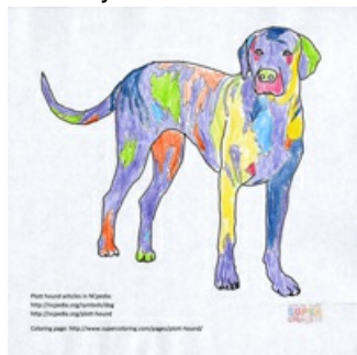
State Symbols Coloring Pages [10]