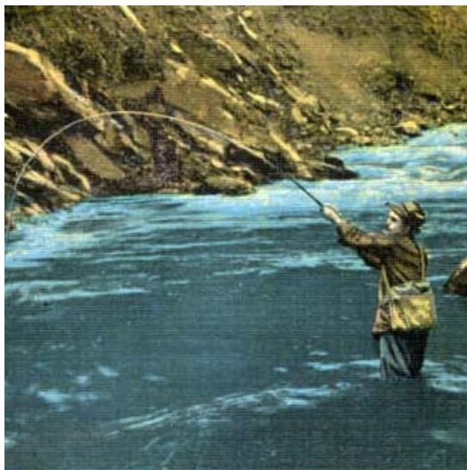
[7] Featured State Symbol