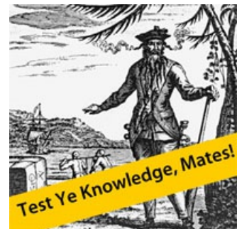
[8] Take a NC History Quiz!