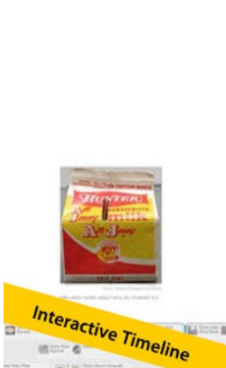
State Symbols Timeline

To read entries about many of North Carolina's most well-known state symbols and the history of North Carolina in Spanish, visit this NCpedia link: https://ncpedia.org/libro-de-hechos-de-el-viejo-estado-del-norte [6]