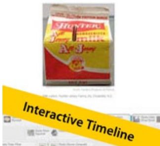
State Symbols Timeline

To read entries about many of North Carolina's most well-known state symbols and the history of North Carolina in Spanish, visit this NCpedia link: https://ncpedia.org/libro-de-hechos-de-el-viejo-estado-del-norte [6]