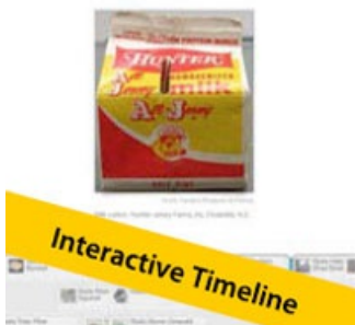
State Symbols Timeline

To read entries about many of North Carolina's most well-known state symbols and the history of North Carolina in Spanish, visit this NCpedia link: https://ncpedia.org/libro-de-hechos-de-el-viejo-estado-del-norte [6]