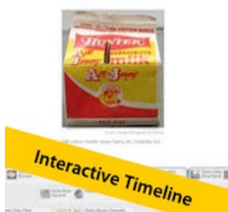
State Symbols Timeline [7]

To read entries about many of North Carolina's most well-known state symbols and the history of North Carolina in Spanish, visit this NCpedia link: https://ncpedia.org/libro-de-hechos-de-el-viejo-estado-del-norte [6]