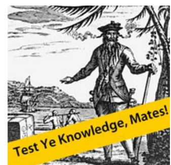
Take a NC History Quiz! [8]