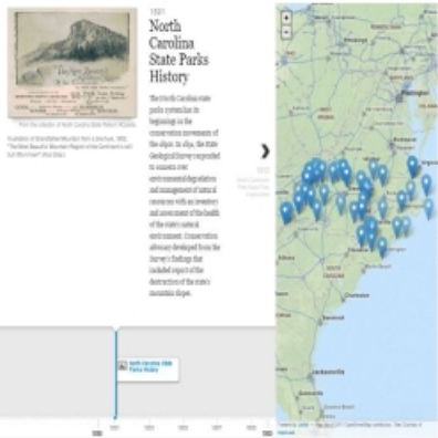
North Carolina State Parks History Interactive Timeline in NCpedia. [2]

The North Carolina State Parks system was launched on March 3, 1915 when the General Assembly passed legislation appropriating funds to buy land for a park at Mount Mitchell. A year later, following the aquisition of 795 acres at the mountain's summit, Mount Mitchell became the state's first park and the first park in the southeastern United States. Today the North Carolina State Parks system covers 225,000 acres from the mountains to the sea.