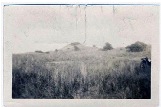
Photograph of the mound battery at Fort Fisher, 1917.

Department of Cultural and Natural Resources.