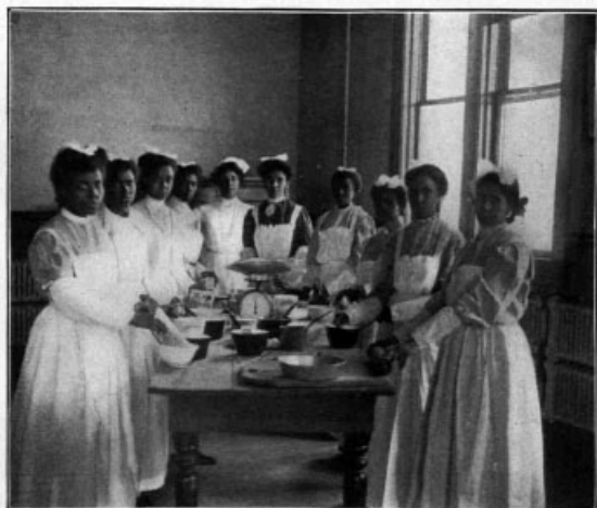
CLASS IN COOKING, JOS. K. BRICK SCHOOL, ENFIELD, N. C.