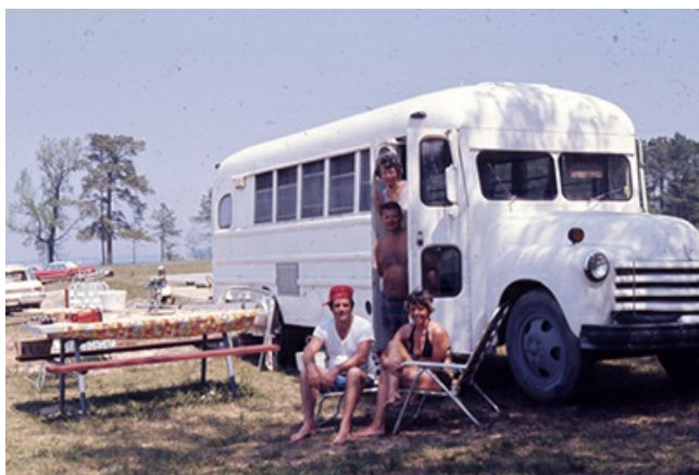
"Campers Come to Kerr Lake in all types of Vehicles." Photograph, ca. 1970.

There are several species of amphibians and reptiles in the area. Frogs, toads, turtles, lizards and snakes are all found here. Most snakes found at Kerr Lake State Recreation Area are harmless. Generally, snakes found in the water are non-venomous water snakes. There is one species, the copperhead, which is venomous and lives on parkland.