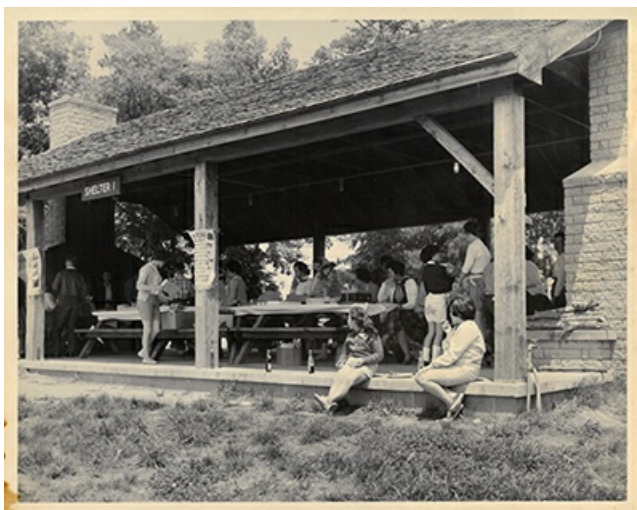
Photograph of a picnic shelter at Kerr Lake, ca. 1950s. The picnic shelters are a popular rental at the recreation area for families, reunions, and social events.

Much of the land that makes up Kerr Lake State Recreation Area is covered by forests in various stages of regrowth that follow the farming and timbering practices of the past. The forests found at Kerr Lake are typical of those found elsewhere in the Piedmont of North Carolina. Pine stands are dominated by loblolly pines. In hardwood forest areas, various oak and hickory species, tulip poplars, sweetgums, maples, American beech and dogwoods are commonly found.