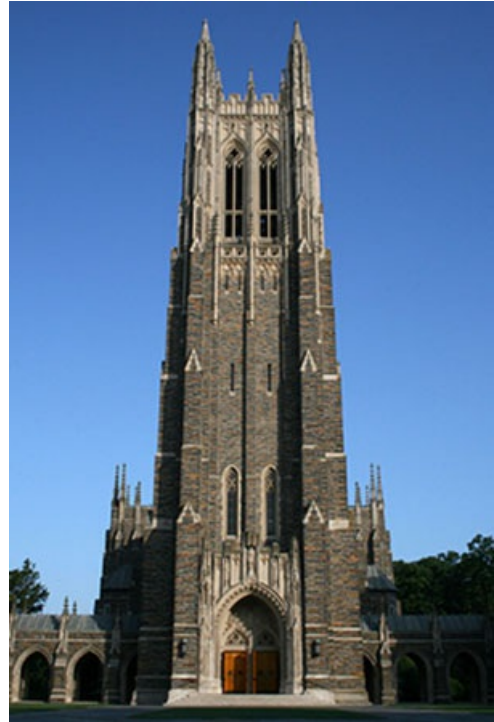
Duke Chapel on a clear morning. Photo by

See Also: Duke University [2] , James B. Duke [3] , 20th Century Architecture [4] flickr user Ildar Sagdejev.