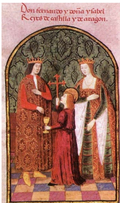
King Ferdinand II of Aragon, and Queen Isabella of Castile.

The Reconquista was a brutal conflict fueled in part by devotion to Christianity -- not just a war between kingdoms but a crusade against infidels [3] . In al-Andalus -- the Arabic name for Muslim-controlled Iberia -- Christians and Jews had significant religious freedom. The Christian rulers to the north did not return the favor. The rulers of Spain's kingdoms found that their shared Christianity could unite them and set them apart from the Muslims to the south. The men who fought in the Reconquista were convinced of their superiority to their enemies who had rejected Christianity, and they developed rules of war based on that superiority -- including the right to enslave the people they conquered. Once Spain was reconquered, Muslims and Jews were forced to convert [4] to Christianity or be expelled from Spain.