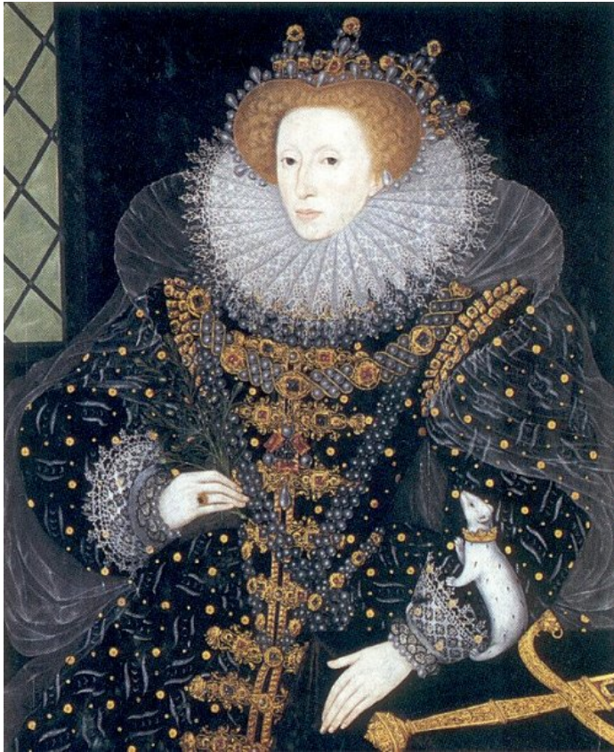
Nicholas Hilliard's 1585 portrait of Queen Elizabeth.

The family tree of the House of Tudor shows how complicated the royal succession could become.