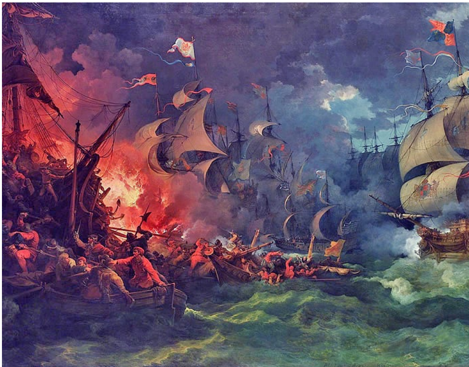
The defeat of the Spanish Armada near Gravelines, France, as depicted by Philippe-Jacques de Loutherbourg in 1796.