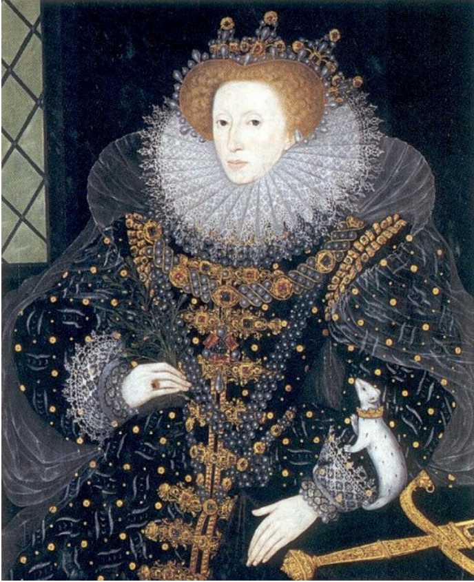
Nicholas Hilliard's 1585 portrait of Queen Elizabeth.

The family tree of the House of Tudor shows how complicated the royal succession could become.