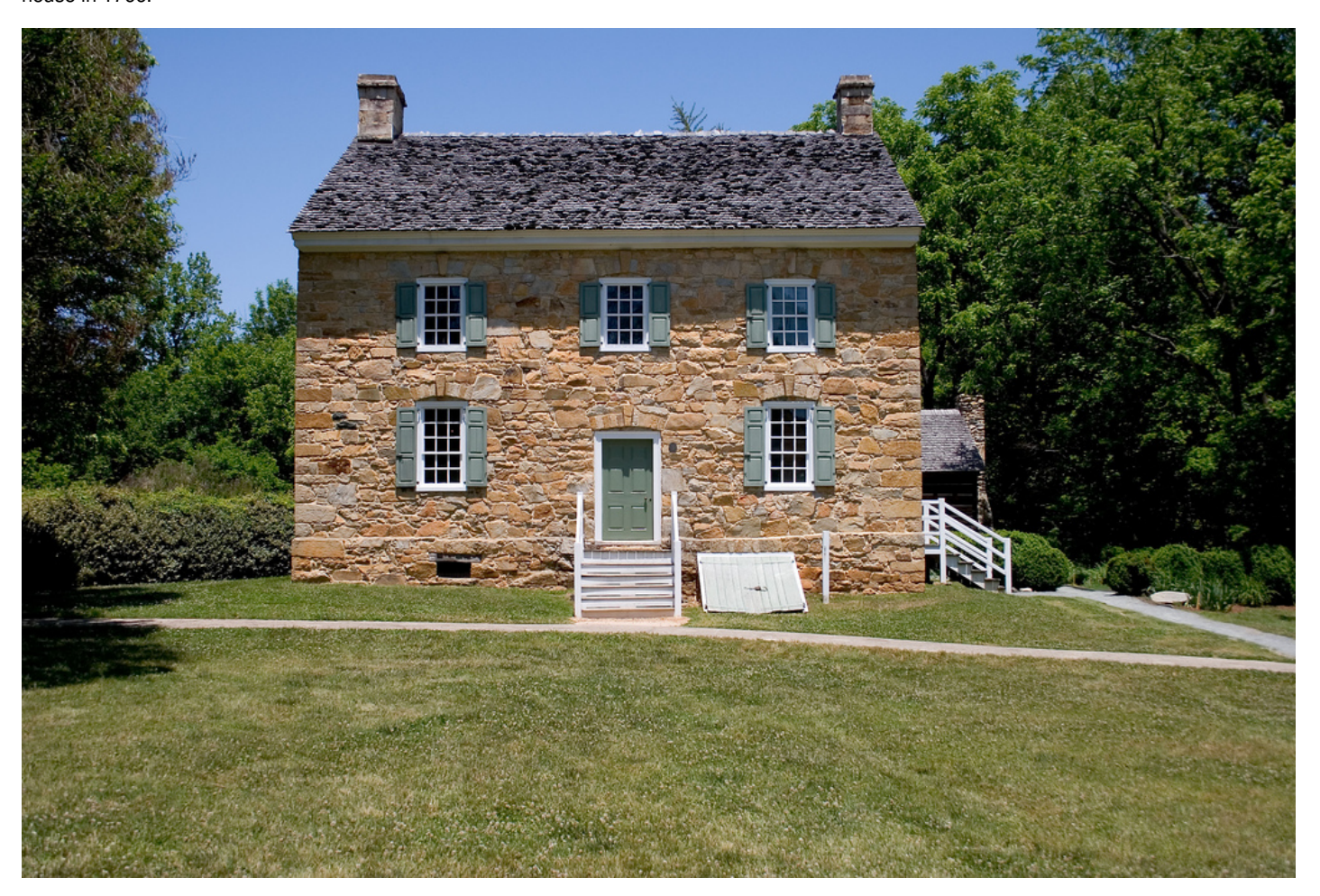
Hezekiah Alexander owned as many as thirteen slaves, a number that placed him in the top 1 percent of slaveholders in late eighteenth-century Mecklenburg County. Alexander's labor force was the simple fact that accounted for the difference of scale between his "Rock House" and the more modest dwellings of nonslaveholders.