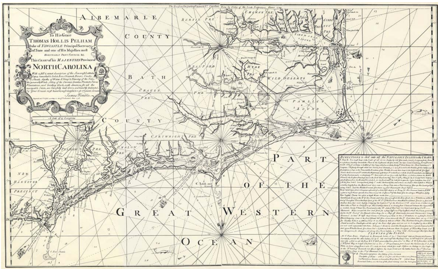
Plate 2. From the files of the State Department of Archives and History, Raleigh. WIMBLE 1738