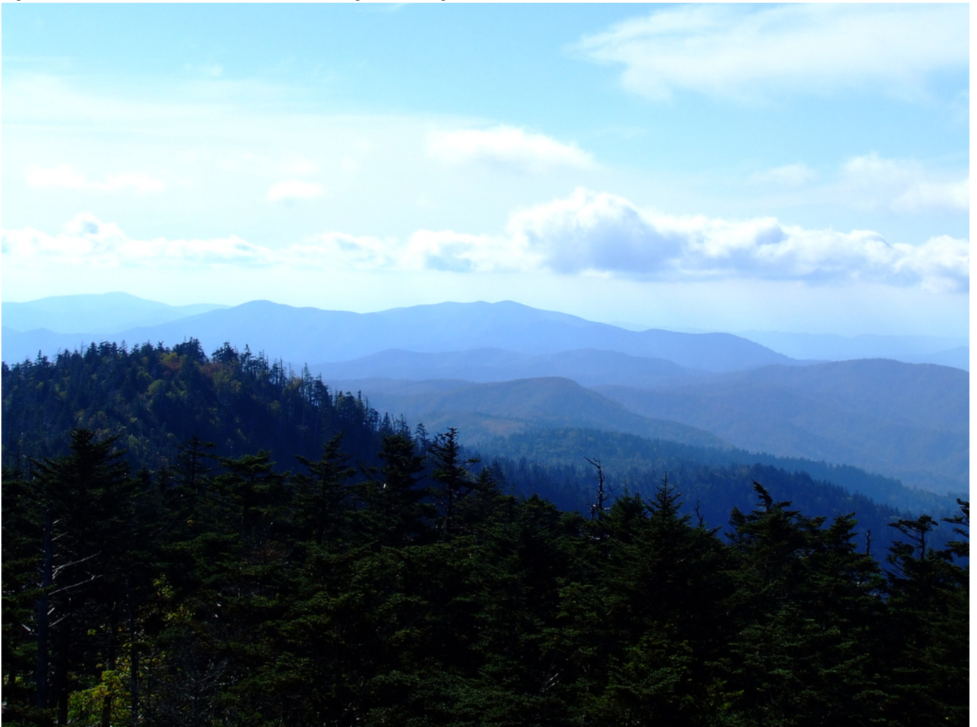
[2] Clingmans Dome, on the border between North Carolina and Tennessee, is the second-highest peak in the eastern United States.