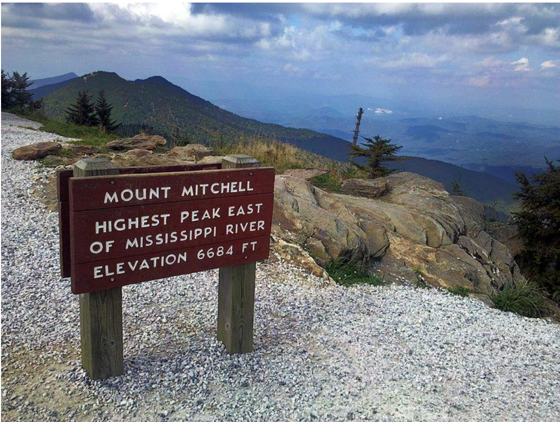
Sign at the summit of Mount Mitchell with Mount Craig in the background. [1]