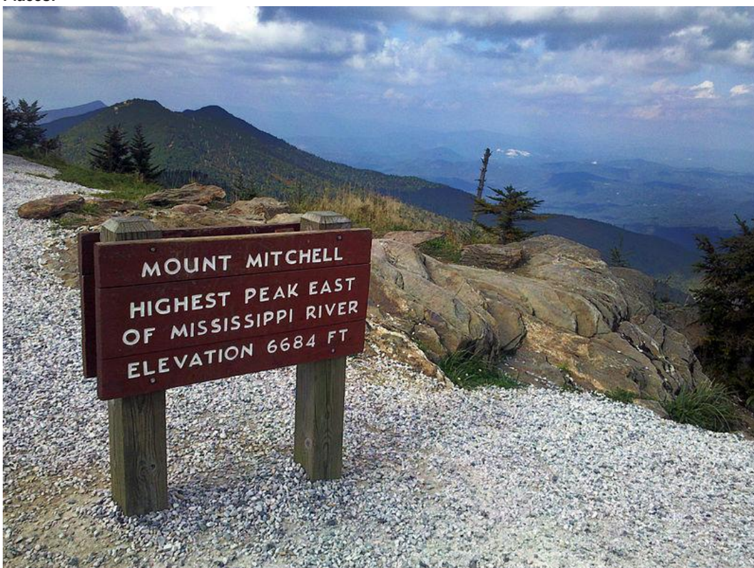
Sign at the summit of Mount Mitchell with Mount Craig in the background.