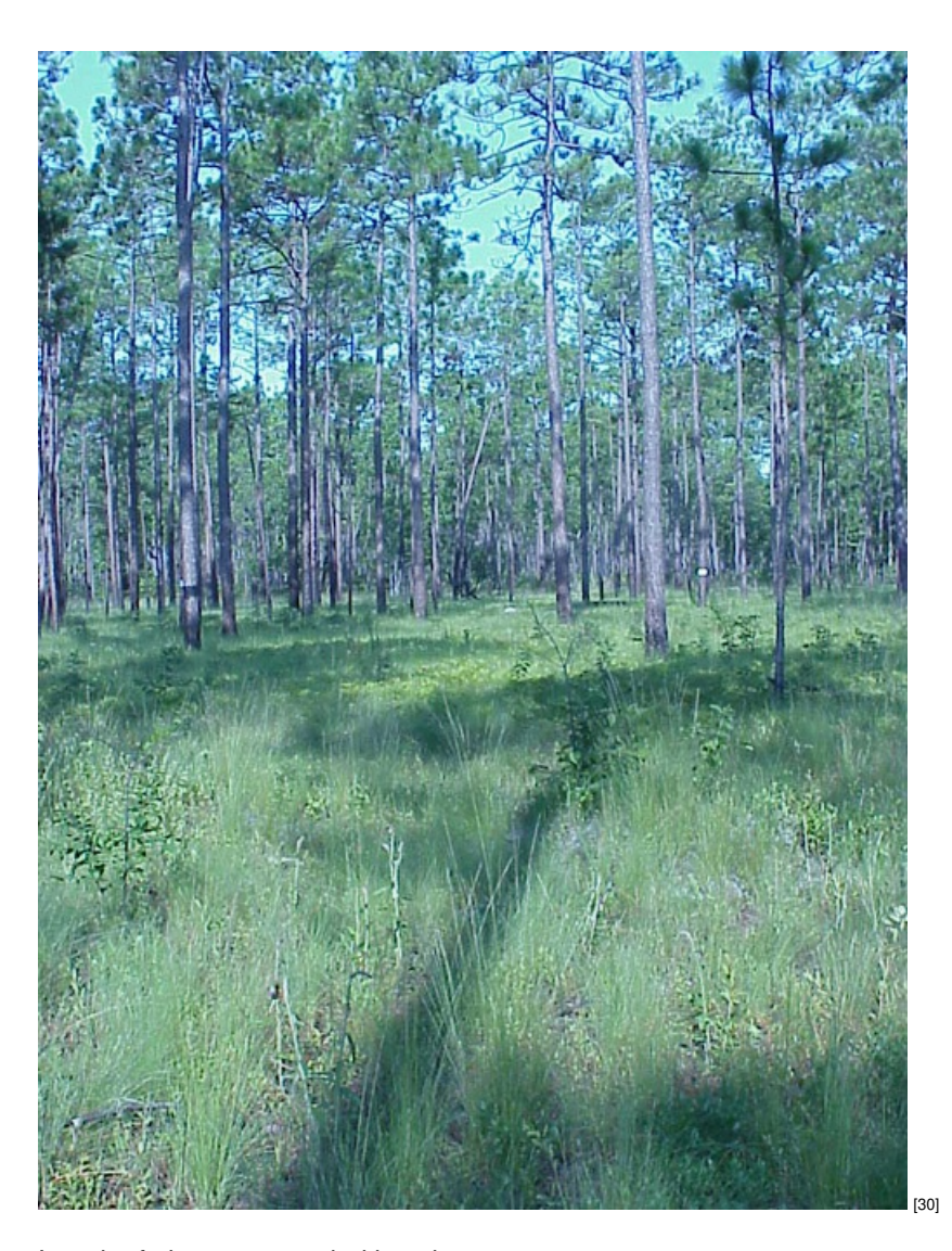
Longleaf pines surrounded by wiregrass.