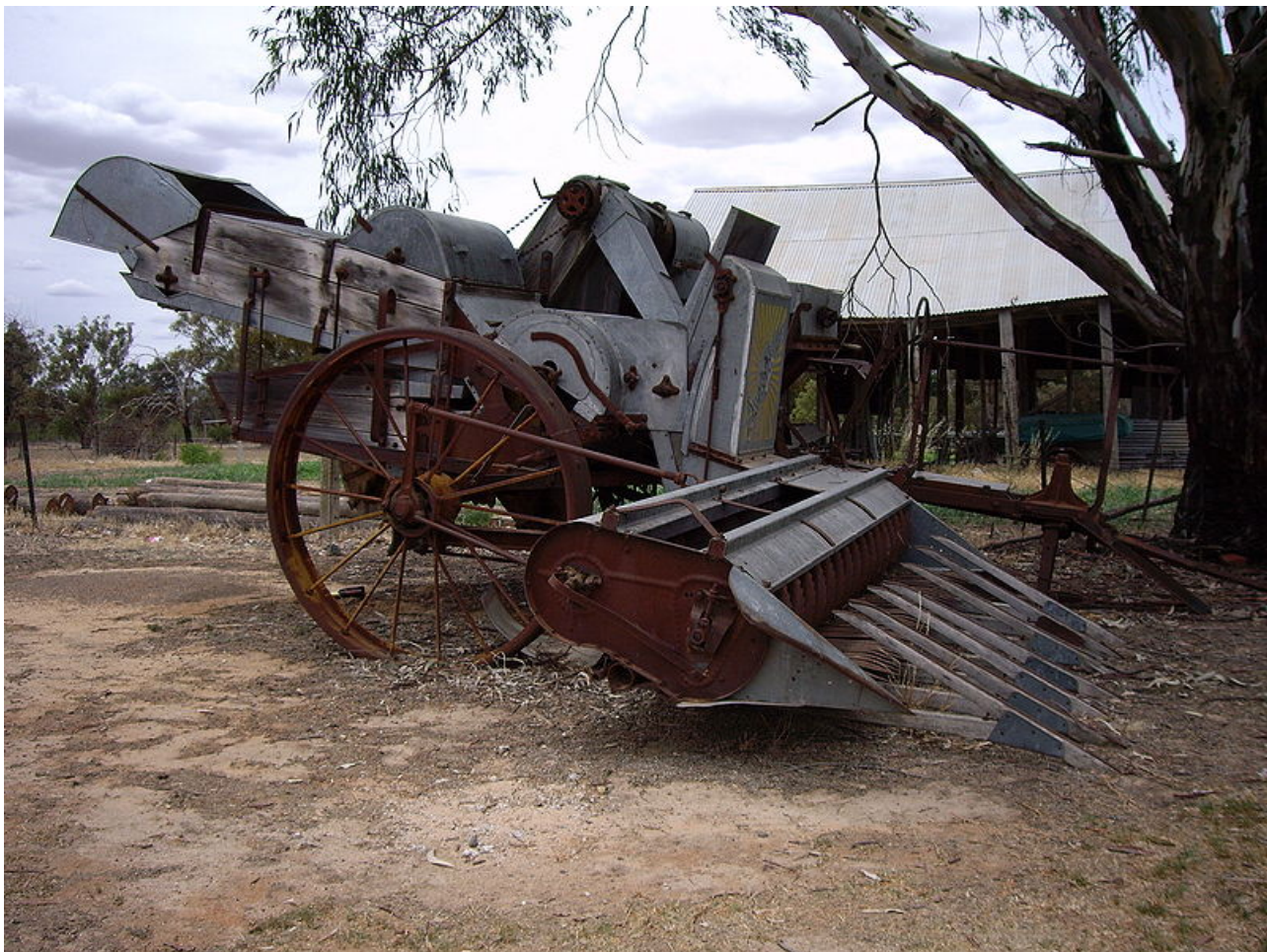
This photo is an example of a combine that added a thresher, which separated the grain from the straw at the same time, combining what had once been multiple processes. [23]