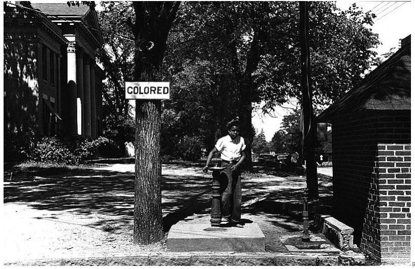
A boy drinks from a "Colored" fountain in Halifax, 1938.