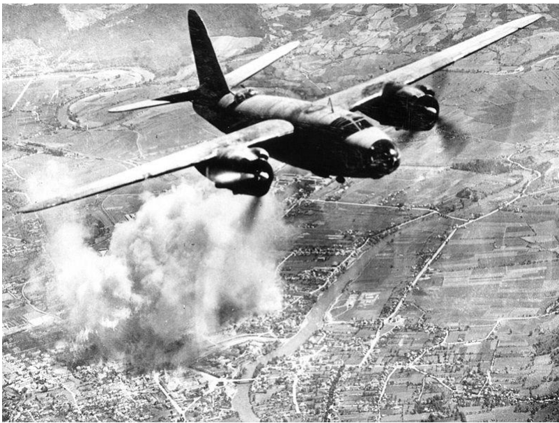
A B-26 bomber over Europe.