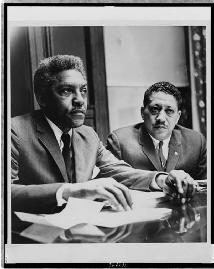
Bayard Rustin [18]