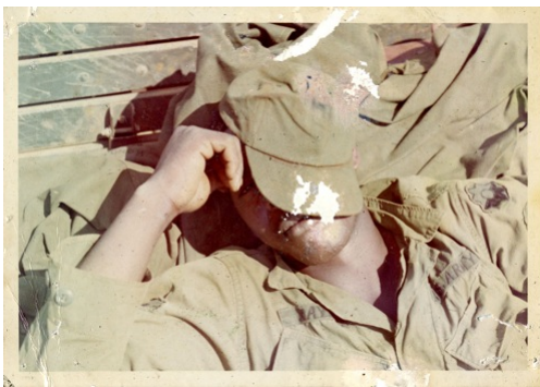
After the explosion.

On Day 173, my Daddy polished his boots for the first time since being in Vietnam. Easter, April 14, 1968 was not a good day for him. My Daddy seems to desperately want to go home now because of some bad news he received, even though he never writes about what happened. No one knew not to send bad news from home to a soldier serving in a war zone. After days of continuous work, eating C-rations, and changing locations, he still anxiously awaits mail from home because he had not received any letters in about nine days. In the meantime, B-Troop continued to lose men. His work seemed to happen simultaneously with the "mess of the war." On Day 146, my Daddy writes about the tank explosion that caused him some minor injuries and burns his face. Because he was not severely wounded enough to be pulled from duty, he returned to work in pain and with some vision problems.