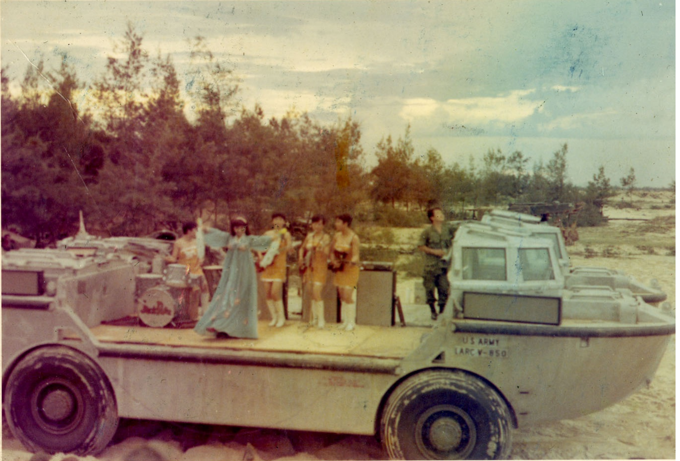
Bob Hope USO show, Christmas 1967