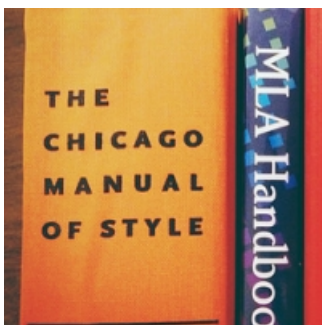
Citing NCpedia & Copyright [4]