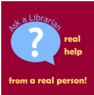
Get help from a librarian [2]

Here are ways to help you get the most from NCpedia and to support your research needs. From live support by real librarians to subject collections and search features, check them out!