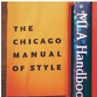
Citing NCpedia & Copyright [4]