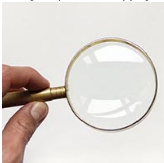
How to Search [5]