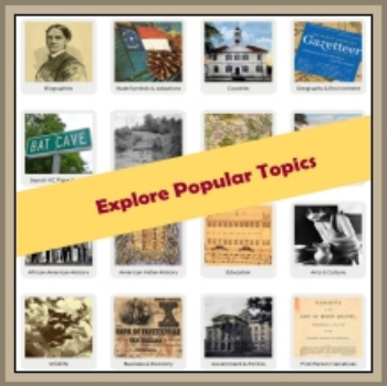
Explore Popular NC Topics [3]