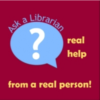
Get help from a librarian [2]

Here are ways to help you get the most from NCpedia and to support your research needs. From live support by real librarians to subject collections and search features, check them out!