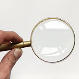
How to Search [5]