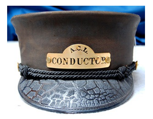
Atlantic Coast Line Railroad conductor's hat, circa 1950.