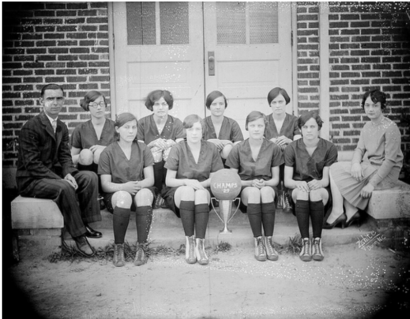
"Unidentified women's basketball players, no date. From the Dunn area."

The game of basketball is much more than a popular spectator and participant sport in North Carolina. Like football in other southern states such as Texas and Alabama, basketball is a statewide obsession that cannot be understood purely by focusing on the histories of individual players, coaches, and teams, statistics for participation in youth and recreational leagues, or other traditional measures. From the sport's first appearance in the late 1890s, basketball has been a vibrant and influential strand in North Carolina's cultural fabric.