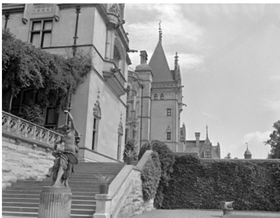
Biltmore House, Asheville, NC, 1950.

Gifford Pinchot [15] managed the reforestation project. The first trained forester in the United States, Pinchot planned New York State's Adirondack Park [16] and founded the U.S. Forest Service [17] . Vanderbilt's forest, named Pisgah Forest [2] , began about 10 miles from Biltmore and extended 60 miles to the west. Pinchot established the Biltmore Forest School [18] and developed a comprehensive plan to continue the tree nursery, reforestation, and harvest projects. His principles of sustained yield, which struck a balance between cutting timber and growing new trees, first developed at Biltmore and remain standard practice in forestry today. The estate also had a dairy farm, a pig farm, and a poultry farm on site.