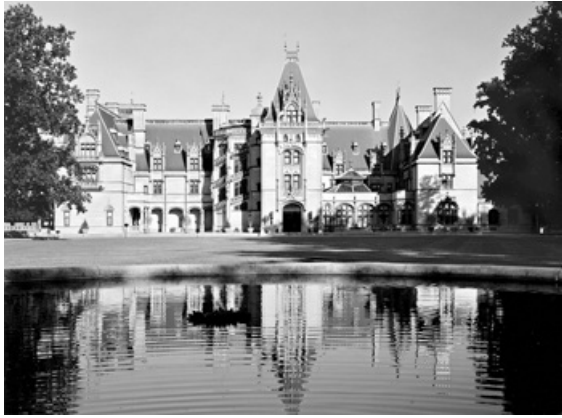
Biltmore House, late 1980s.

Architect Richard Morris Hunt, designer of New York's Tribune Building and the base of the Statue of Liberty, modeled Biltmore Village after a Swiss village.