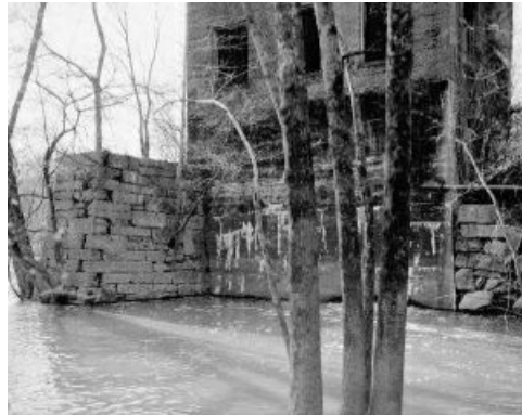
"View showing east elevation of powerhouse and masonry retaining walls- Lockville Hydroelectric Plant, Deep River, 3.5 miles upstream from Haw River, Moncure, Chatham County, NC." Image courtesy of Library of Congress, call #: HAER NC,19-