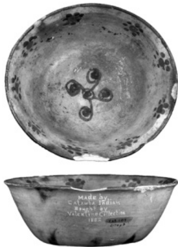
Catawba Indian-made pan with hand-painted floral decoration, ca. 1880s.

Catawba Indians are often referred to as the Catawba Nation, a term that describes an eighteenth-century amalgamation of different peoples that included the Catawba Indians. Historically, the Indians who came to be called "Catawba" occupied the Catawba River Valley above and below the present-day North Carolina-South Carolina border. They are descended from a large group of independent peoples in the Catawba Valley who spoke a Siouan language.