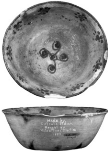
Catawba Indian-made pan with hand-painted floral decoration, ca. 1880s.

Catawba Indians are often referred to as the Catawba Nation, a term that describes an eighteenth-century amalgamation of different peoples that included the Catawba Indians. Historically, the American Indians who came to be called "Catawba" occupied the Catawba River Valley above and below the present-day North Carolina-South Carolina border. They are descended from a large group of independent peoples in the Catawba Valley who spoke a Siouan language.