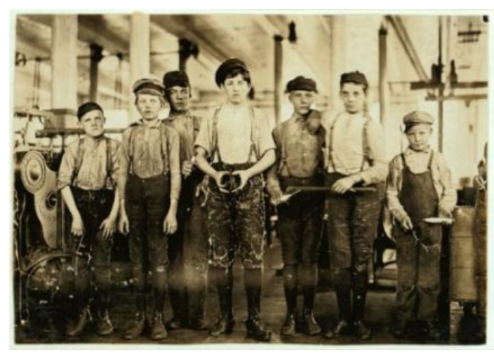
Boys working at the Ivey Mill Company, Hickory, North Carolina.

perspective. The committee achieved limited progress in advocating for legislative restrictions on child labor: the maximum workweek was reduced from 66 to 60 hours, no child under 16 could work at night, and no child under 13 could be employed in the mills, although 12-year-olds could work in an "apprenticeship capacity." The organization was unsuccessful in raising the minimum age to 14 and in obtaining measures for effective enforcement of factory inspections, as North Carolina's child labor regulations continued to lag behind those of most states.