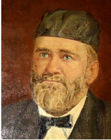
Portrait of William Laurence Saunders.