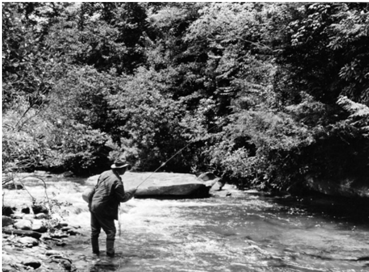
Fishing in stream in Pisgah National Forest, no date, unidentified fisherman. From Carolina Power and Light (CP&L) Photograph Collection, North Carolina State Archives, call #:

Forests- Part 3: Efforts to Protect North Carolina Forests and Trees [7]