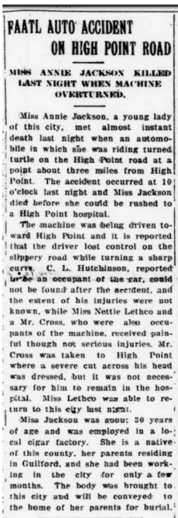
Image of a newspaper account from June 6, 1920 of a fatal car accident near High Point and Jamestown, N.C.