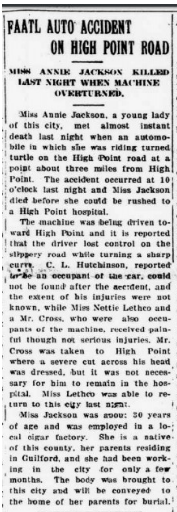
Image of a newspaper account from June 6, 1920 of a fatal car accident near High Point and Jamestown, N.C.