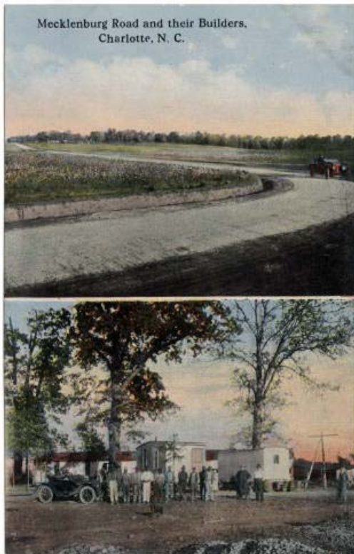
Postcard images of Mecklenburg County road and road builders, 1915-1930.

See also: The Way We Lived in North Carolina: Introduction [2] ; Part II: An Independent People, North Carolina, 1770-1820 [3] ; Part III: Close to the Land, North Carolina, 1820-1870 [4] ; Part IV The Quest for Progress: [5] North Carolina 1870-1920 [6] ; Part V: Express Lanes and Country Roads, North Carolina 1920-2001 [7] ; Automobiles for K-8 Students [8]