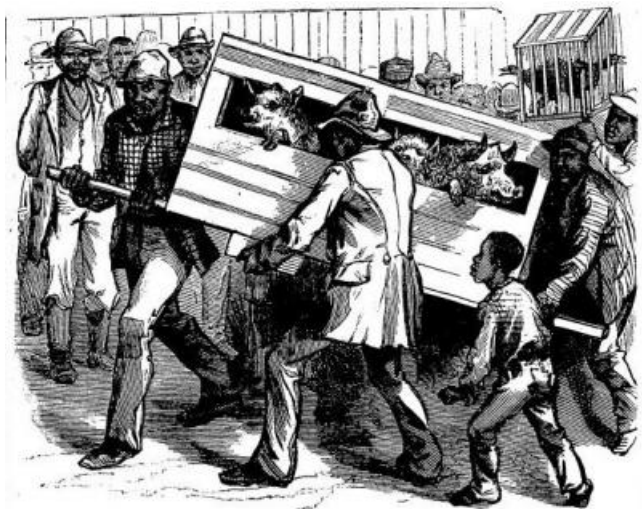
INTENDING EXHIBITORS BRINGING IN LIVE-STOCK AND POULTRY.

This fair took place in Raleigh on November 17-20 1879.