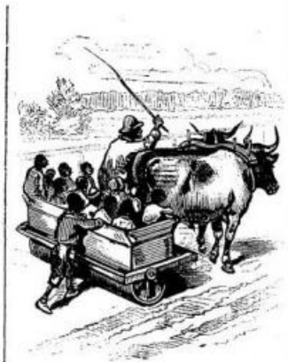
ROLLING THE RACE-TRACK.