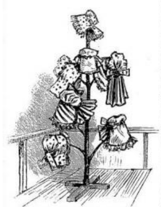
SUNBONNETS AT THE FAIR.