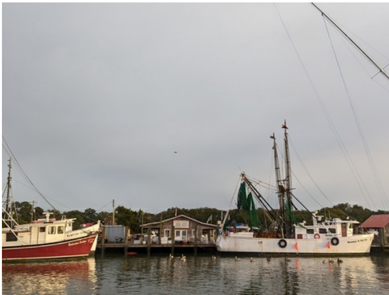
Geechie Seafood in Shem Creek, SC. This restaurant served as the inspiration for Heyward's seafood market in the show.

Surfing features prominently in the first season, where John B., JJ, Pope and Kiara are seen shredding the infamous OBX waves. In season two, JJ gives a nod to a local surf shop by wearing a shirt from Whalebone Surf Shop [7], which is located in Nags Head [8]. Throughout other scenes, we see 'Kildare Island Surf Shop' on hats, shirts, and even a sticker in Pope's bedroom. The Pogues hang outside the front of the shop. Just as the name of the island is fictional, so too is the Kildare Surf Shop. However, there are plenty of real surf shops to grab a souvenir shirt, sign up for surfing lessons, or purchase your own board. There are also several surf events that amateurs and professionals travel to the Outer Banks to compete in.