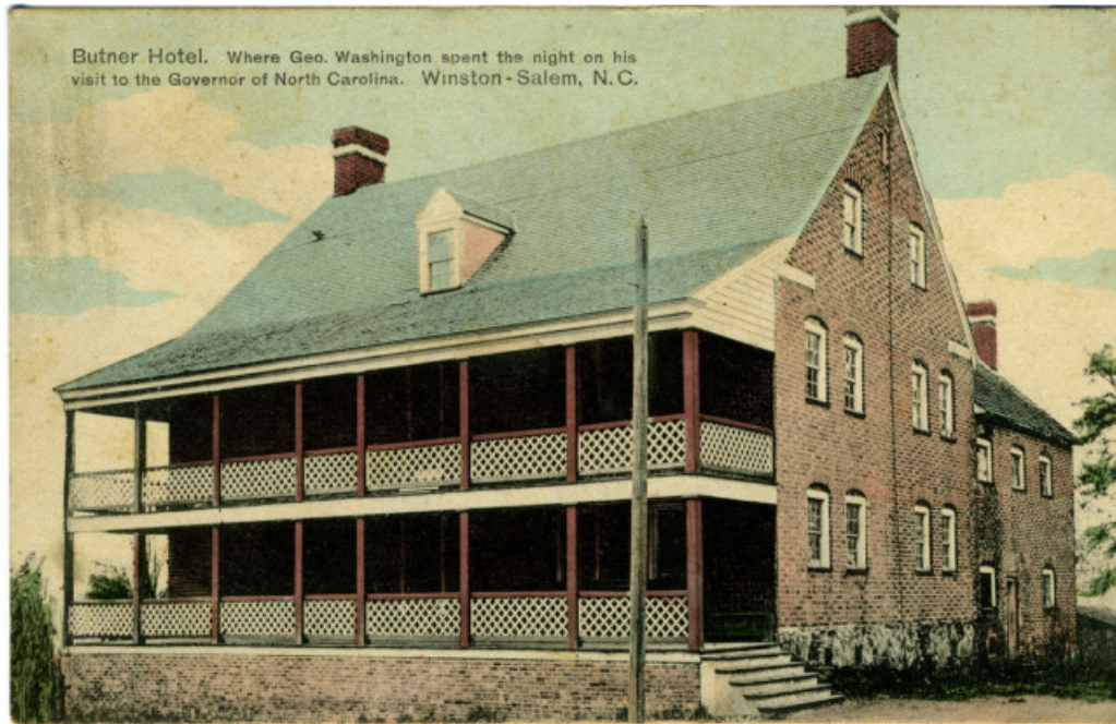
Postcard of the Salem Tavern (then called the Butner Hotel), circa 1908. -Salem, N.C. Image from the North Carolina Collection Photographic Archives, UNC-Chapel Hill.

See also: Salem Tavern [2] ; Travelers' Rooms [3] .