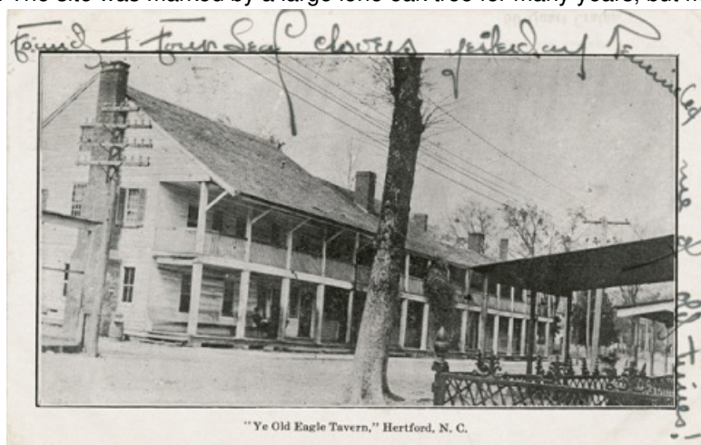
Postcard of "Ye Old Eagle Tavern," Hertford, N.C. Image from the twentieth century.

Pop Castle was a legendary inn and recreation center in colonial Granville County [15] at a site now in Vance County [16] , one mile west of Kittrell. It was reputedly first occupied by an unidentified nobleman, a political refugee from Europe, and later owned by one Captain (Nathaniel?) Pope, a pirate [17] who was said to have buried gold [18] nearby. Known for a time as Popecastle Inn, it was soon altered to Pop Castle by local usage after an adjoining cockfighting pit and tavern began to attract people. A racetrack [19] was laid out during the Revolution [20] . The main building of the inn was finally taken down after the Civil War [21] . The site was marked by a large lone oak tree for many years, but myths of Pop Castle survived into