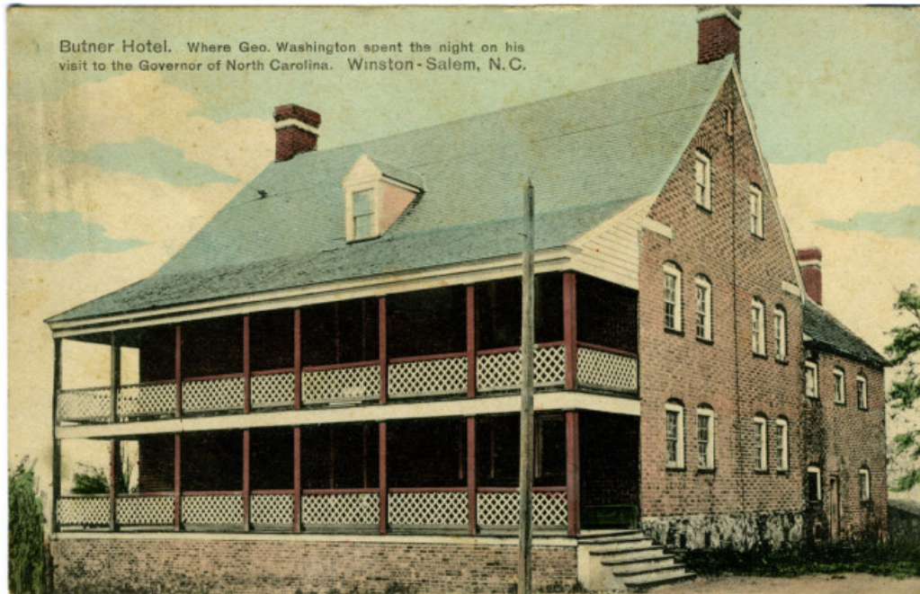
Postcard of the Salem Tavern (then called the Butner Hotel), circa 1908. -Salem, N.C.

See also: Salem Tavern [2] ; Travelers' Rooms [3] .