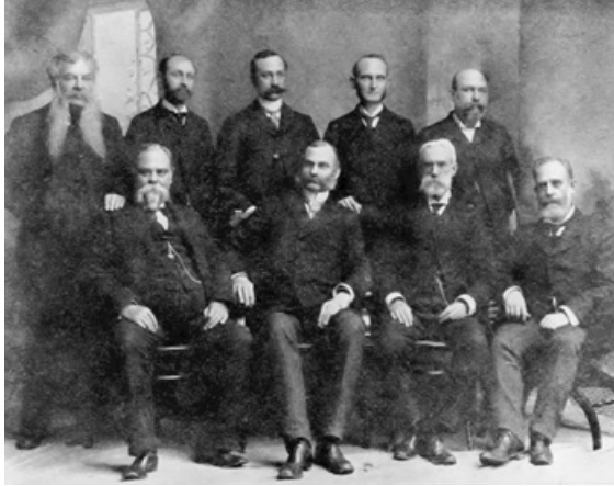
Faculty of Leonard Medical School, ca. 1902.