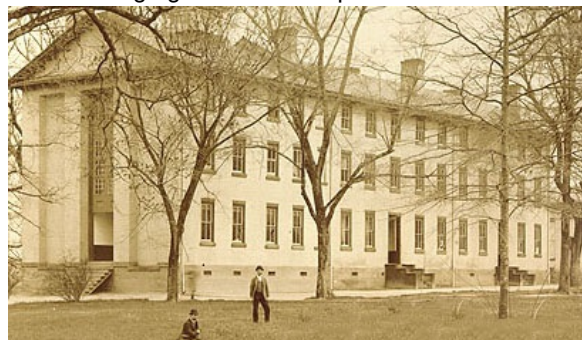
"Old East, ca.1892. Kemp Battle photo album VC378 UVF; negative 77-477." Available from the North

Originally built in two stories, Old East acquired a third level in 1823 to mirror Old West, constructed opposite it. The "north towers" were added to both buildings in 1848, extending them and bringing them to their present dimensions. Most of the