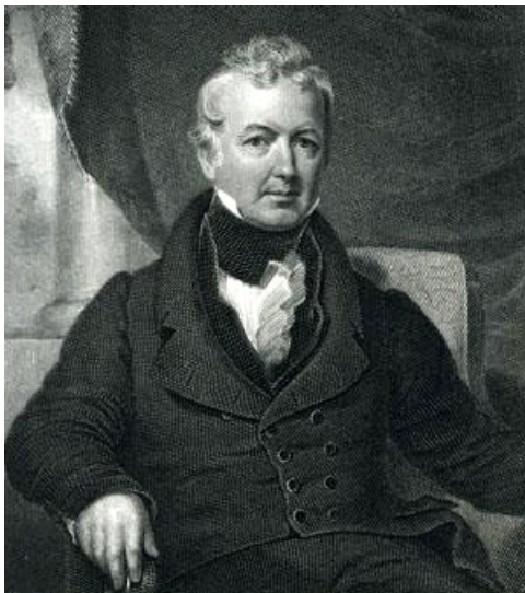
Lithograph print of William Gaston.