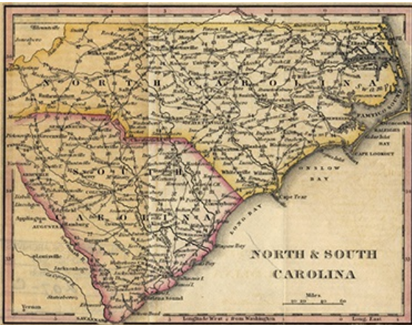
Map of North and South Carolina, showing Post Roads and mileage, 1828.