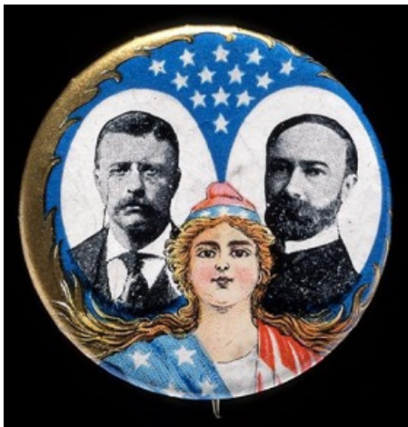
Button for the 1904 Roosevelt/Fairbanks Republican presidential campaign.

Cracks in the Democratic one-party domination of twentieth-century North Carolina politics did not appear again until the 1920s, when some Republicans began to portray themselves successfully as the "lily-white" party. Republicans carried the state in the 1928 presidential election, as many Democrats opposed Al Smith's candidacy, which they dubbed "rum and Romanism" in reference to his anti-Prohibition views and Catholic faith. That year Charles A. Jonas became the first Republican elected to Congress from North Carolina (his son Charles R. Jonas became the second Republican congressman in 1952 and was reelected to nine successive terms). Dwight D. Eisenhower's popularity in the state in his 1952 and 1956 presidential runs were further examples of Republican success during this era.