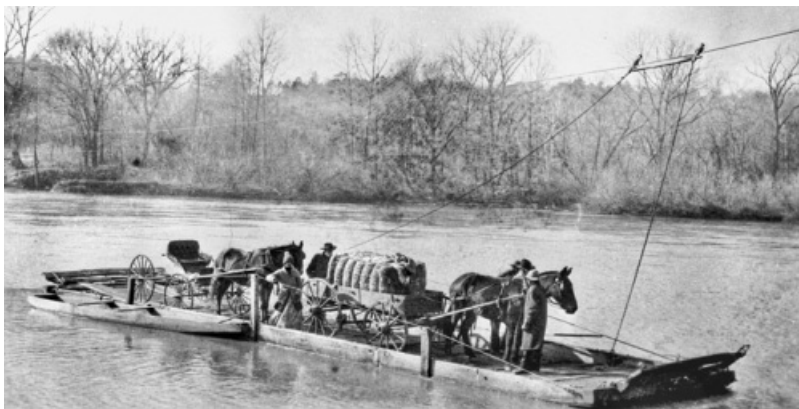
Hannah's Ferry on the Yadkin River between Davie and Rowan Counties, ca. 1900. Courtesy of North Carolina Office of Archives and History, call #: N_62_8_53.

Following the American Revolution [35] , particularly in the first half of the nineteenth century, North Carolina undertook a program of internal improvements [36] to enhance its economy, an important facet of which was to improve the navigability of watercourses. During and after the colonial era, the legislature empowered the county courts to order the clearing of navigable rivers and streams within their jurisdictions. From the Revolution to the Civil War, however, the General Assembly [37] often addressed specific waterways, mandating the county courts to require mill owners to provide slips for the passage of boats and occasionally appointing individuals to clear streams. Generally those efforts were unproductive.