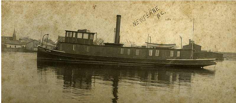
Tug boat "Lillie" in New Bern, NC, early 1900s.

See also: Blossom's Ferry [2] ; Cape Fear and Deep River Steam Navigation Company [3] ; Ferries [4] ; Steamboats [5] ; Albemarle Steam Navigation Company [6] ; Yadkin River Navigation Company [7] ; Tar River Navigation Company [8] ; Dan River Steam Navigation Company [9] ; Neuse River Navigation Company [10] ; New River Navigation Company [11] ; Deep and Haw River Navigation Company [12]